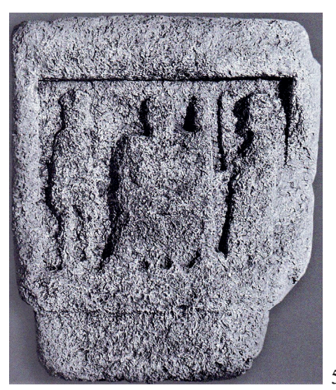
Fig. 1. Votive relief depicting Cybele, Hermes and Hekate found on the territory of the Northern Black Sea Coast: 1 – from Olbia (by Kobylina 1978, 67, rys. 11); 2, 3 – from Kertch (by Shkorpil 1914, 17, rys. 6; Marti 1934, 66, rys. 5); 4 – from the vicinity of the Nymphaion (by Marti 1934, 66, rys. 4); 5 – from Tyritake (by Antichnaya skul'ptura 2004, 66)