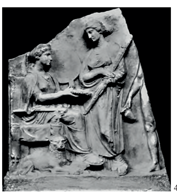
Fig. 2. Votive relief depicting Cybele, Hermes and Hekate from Attica: 1, 2 – from Athens (Schrader H. 1896, 278-279); 3, 4 – from Piraeus