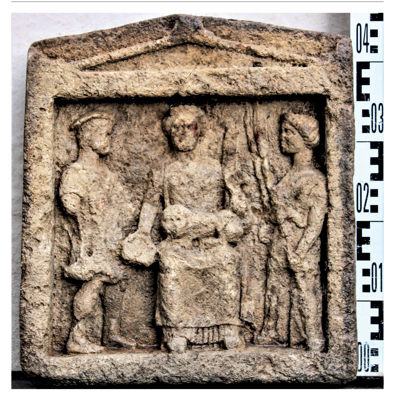
Fig. 3. Votive relief from Gorgippia