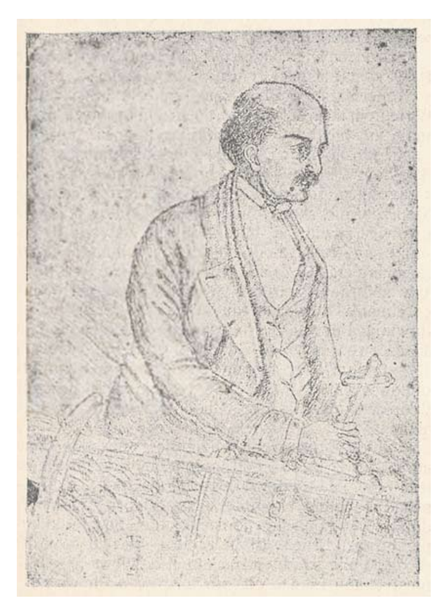
Fig. 3. Teofil Wiśniowski on his way to execution , after a drawing by Sydonia Jazłowiecka, Po śmiertelnej drodze , "Na ziemi naszej" 1910, no. 5, p. 35.