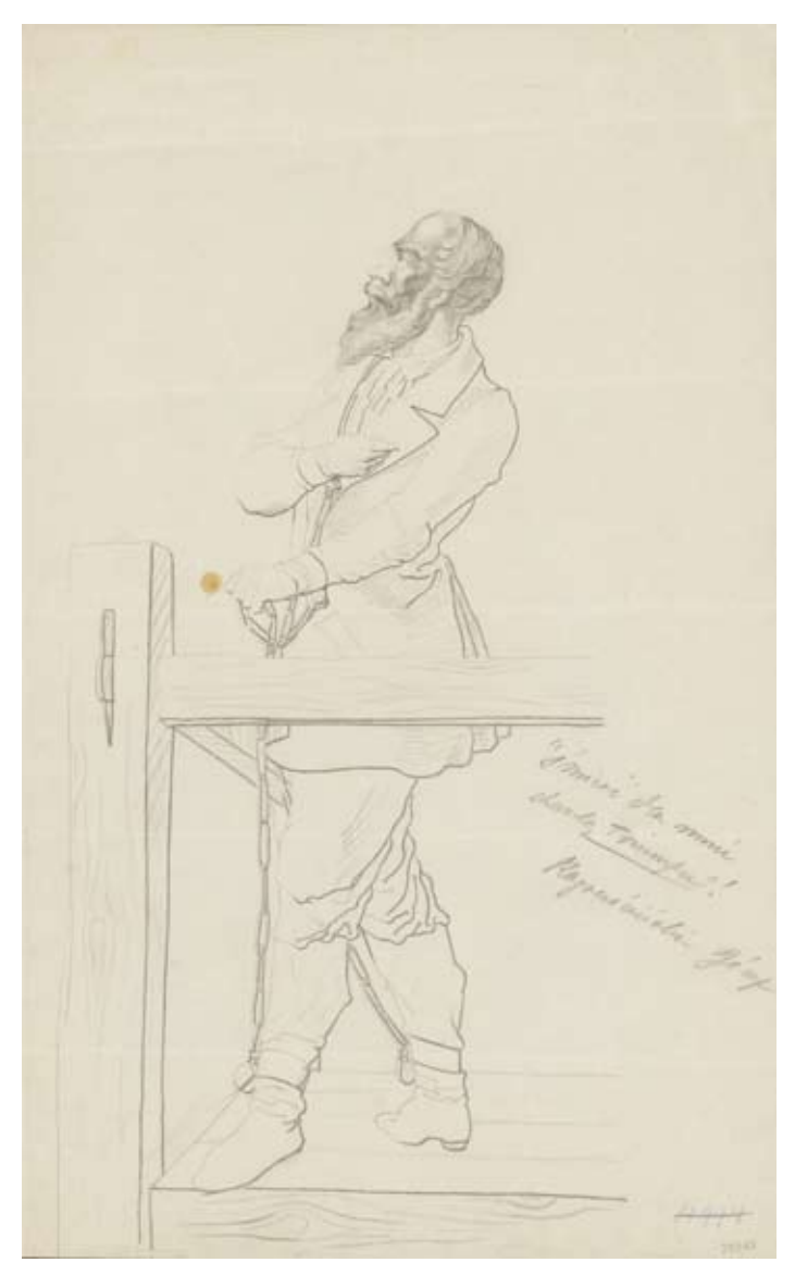
Fig. 2. Szczęsny Morawski, Józef Kapuściński during the reading of the sentence , 1847, rysunek, Vasyl Stefanyk National Academic Library of Ukraine, inv. no. 39087.