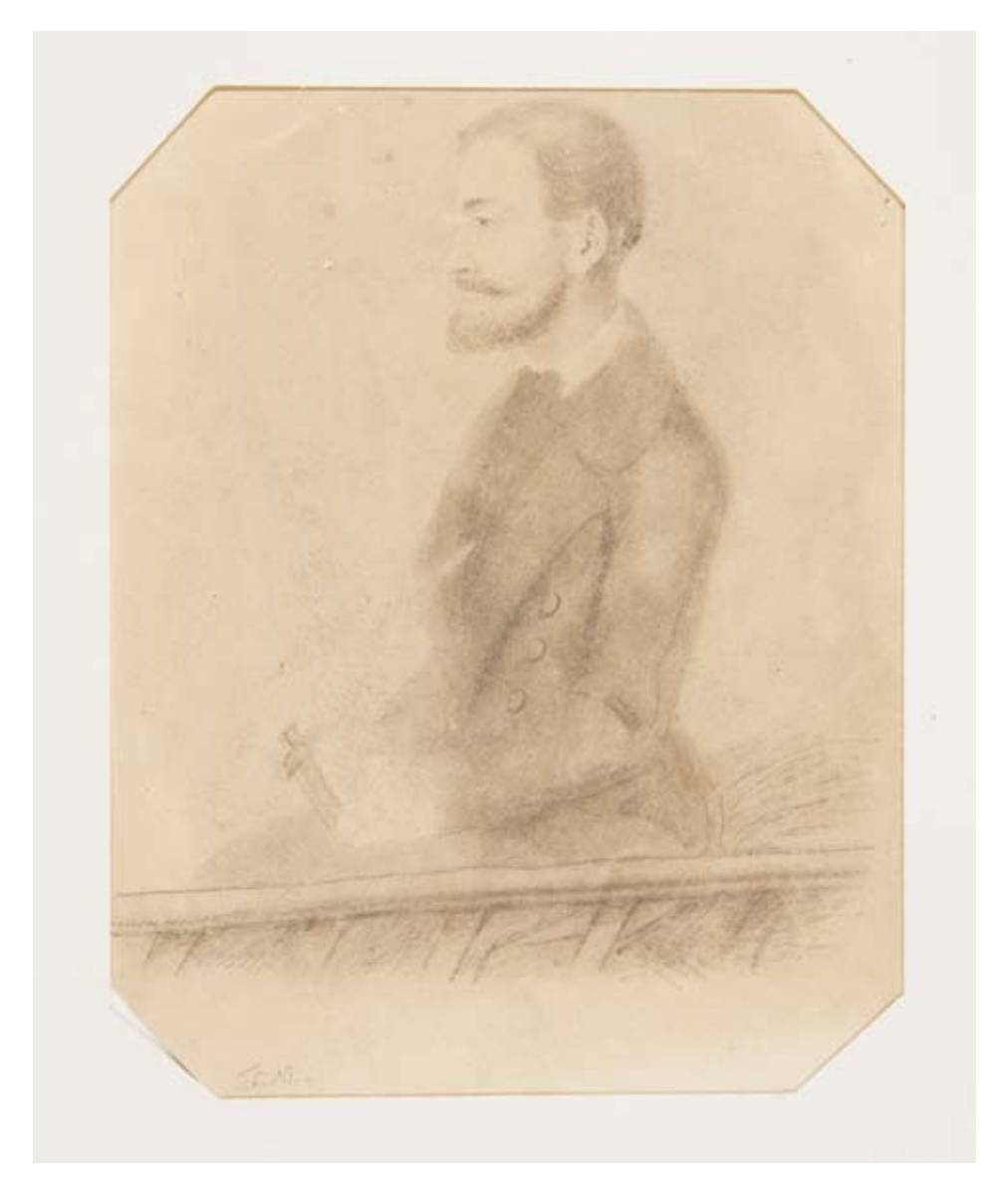
Fig. 5. Author unknown (Szczęsny Morawski?), Józef Kapuściński on his way to execution , drawing, National Museum in Kraków, MNK III-r.a-14274.