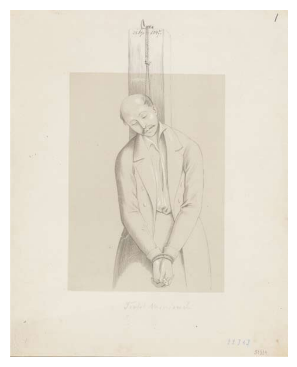
Fig. 6. Author unknown, Teofil Wiśniowski on the gallows , drawing, Vasyl Stefanyk National Scientific Library of Ukraine, inv. no. 51334.