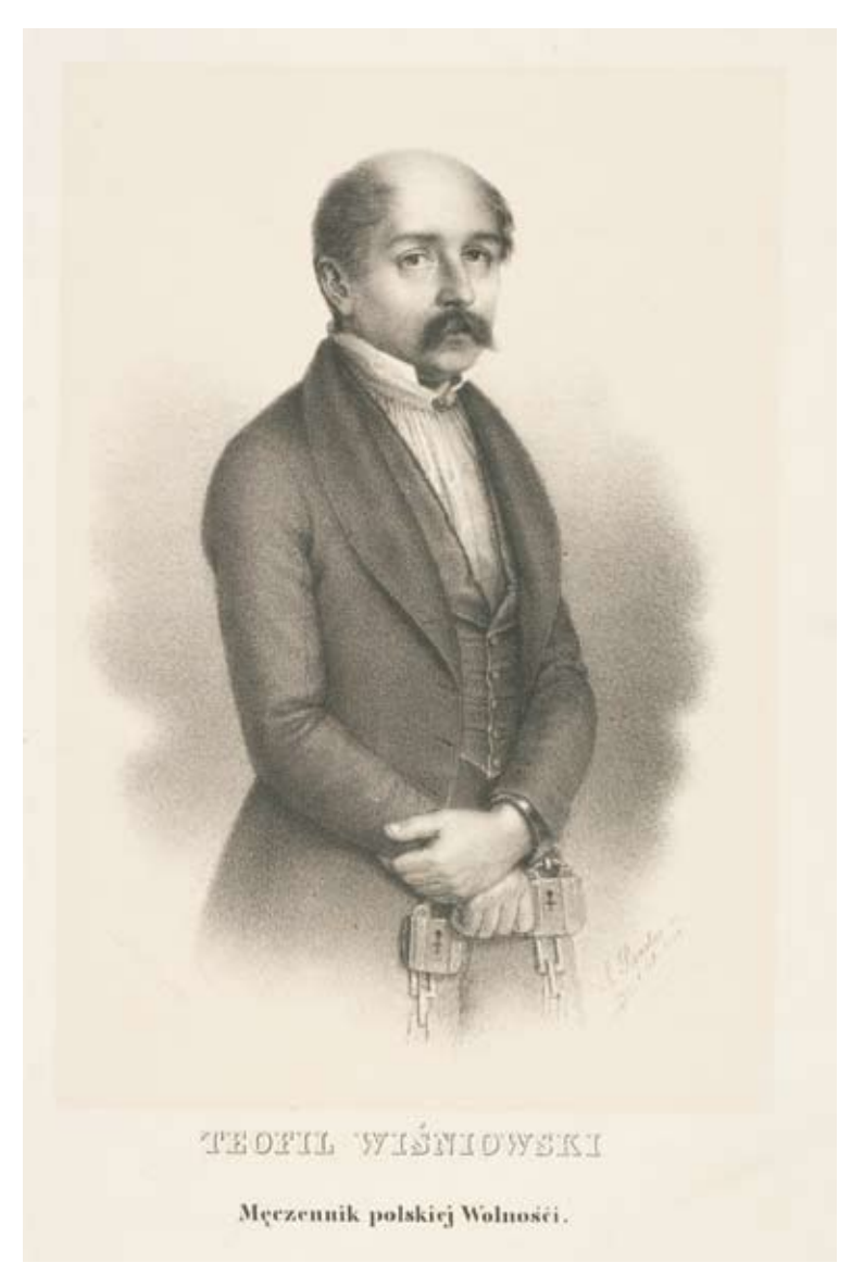
Fig. 9. Stanisław Bartus, Teofil Wiśniowski martyr of Polish freedom, 1848, lithograph, National Library in Warsaw, inv. no. G.6228/III.