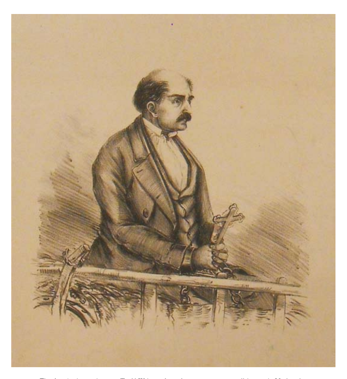
Fig. 4. Author unknown, Teofil Wiśniowski on his way to execution , lithograph, National Museum in Kraków, MNK III-N.I.-6747.