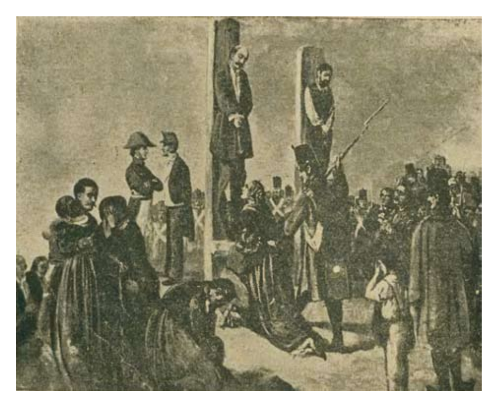
Fig. 7. Filipowski, The execution of Wiśniowski and Kapuściński , "Ilustrowany Kuryer Codzienny" 1927, no. 210, p. 5.