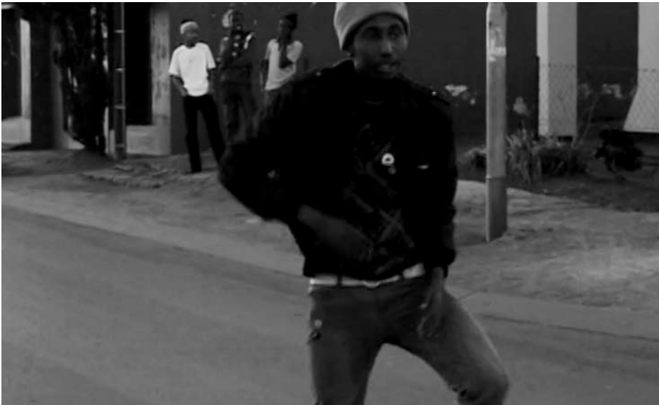
II. 2. Palesa Shongwe, Atropy , video still, 2010, courtesy of the artist

located in time and space. Images of the girls and women from the past dancing, and of contemporaneous men and women also dancing, appear not as scientific data, but as examples and evidence of some broader practices – of ritual and of youthful free-play – in each case allowing one to regain “the memory of one’s past lives” in a communion with the community, or in the young-and-free’s glamorous movements in a confined space. Shongwe perceives these practices as part of the game of power and the politics of space, which is negotiated by the movements that shatter the confining suburban environment. The expression present in her video is external to the Western metaphysics of the subject, descending to the anthropological core, giving it the value of (limited, relative) universality. The sincerity of the artist, not the search for objectivity, allows us to feel a common truth about our body/mind/soul connecting us with the past, with our ancestors and community, but also to reflect on the specific bodily experience and its expression by the young black people in the 20 th and 21 st century.