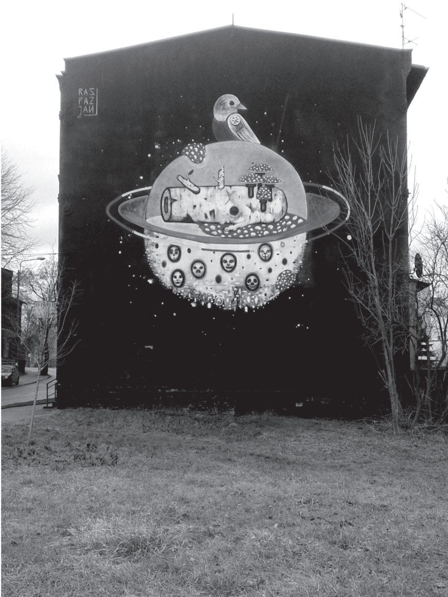
1. Katowice, Raspazjan.