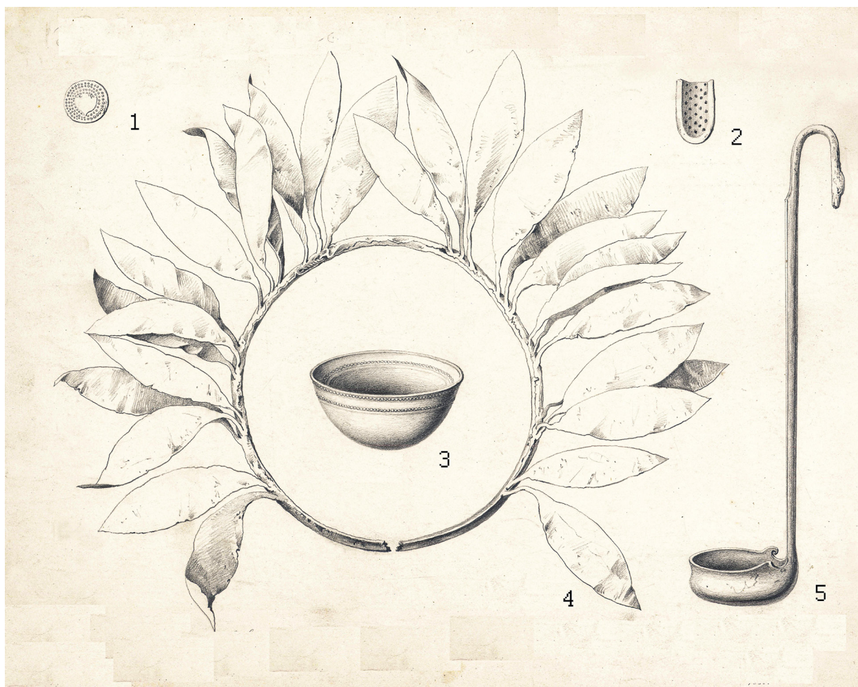
Fig. 4. Finds from Tomb 57 (drawing by F.I. Gross)

The silver ladle (Fig. 4, 5), by which the wine was poured out into cups (Fig. 4, 5), corresponds well to the type characteristic for the late Hellenistic period, with its deeper scoop when compared to earlier objects. 19 Similar ladles were found in the Artyukhovskiy kurgan. 20 A silver strainer (Fig. 4, 2) is clearly connected with the wine sphere, but it seems to have no analogies among the repertoire of Bosphorus archaeology.