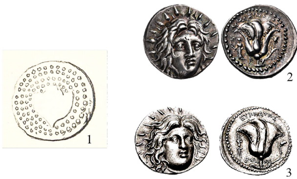
Fig. 5. Gold impression from Tomb 57 (1) and silver Rhodian coins (2-3)

have been rouge, then it would be logical to suppose that the burial belonged to the woman. However, the inventory of the burial would not correspond with such an attribution. It is most probable that tomb no. 57 belonged to a male. Items normally associated with female burials, such as a mirror, beads, ear-rings, etc. are absent.