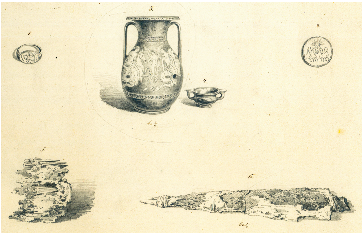
Fig. 1. Finds from the Second Small tumulus of the Yuz-Oba necropolis (drawing by F.I. Gross)

objects. 4 A gold disk, on which the image of Helios in a radiant crown on the chariot was imprinted, is especially interesting in this context (Fig. 1, 2). This tomb certainly belongs to the second half of the 4th century BC, and most likely to the end of the century. In other words, interest in Rhodes among members of the Bosphoran aristocracy was already apparent before the 3rd century BC.