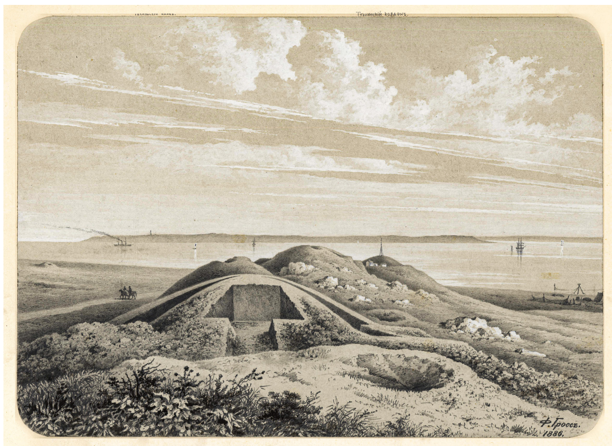
Fig. 2. Excavations on Tuzla cape (drawing by F.I. Gross)

ancient settlements, ancient tombs, together with the remarkable finds which came from them, etc. 8 Without these pictures, our knowledge of Bosporan antiquities would be very much more limited, deprived of a significant part of the pictorial record, and therefore of the imagery, brightness and charm which abound in the drawings of the mounds of the Tuzla cape (Fig. 2) which F.I. Gross made. There is nothing to be seen resembling the drawings of F.I. Gross nowadays, only steppe the Tuzla cape, only steppe landscape. He wrote in his report on the excavations wrote that these mounds for the most part were piled on natural rocky hills 'and therefore not as large as they appear at first glance'. Practically all of them were robbed, 'only some of tombs in the periphery sides of the mounds survived, probably, because of ignorance of the robbers of their locations'. 9