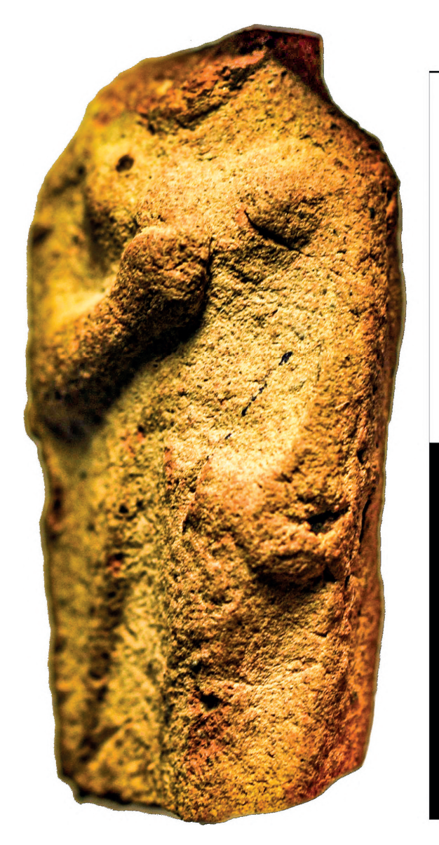
Fig. 3. The depiction of terracotta figurine, details of the frontal side.

of the himation falls down at the right side of the woman's body (Fig. 4) are very suggestive, and comparable to the style and to the treatments of details which we find on the find from Nikonion This analogous figure is dated to the late archaic period.<sup>16</sup>