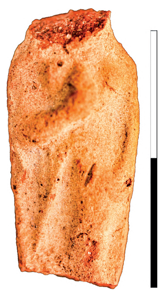
Fig. 1. The depiction of terracotta figurine, frontal side.

and the woman's breasts are silhouetted under the fabric. The back side is presented schematically. The hair falling on the woman's shoulders are shown as a smooth surface without any additional details. Also, the waist and the bent elbow of the woman's left hand are clearly visible (Fig. 3).