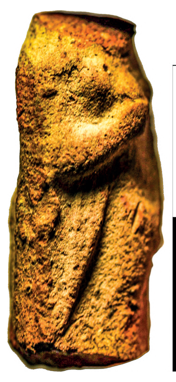
Fig. 4. The depiction of terracotta figurine, details of the side and frontal surface.

of Greece. Figurines of this type are often found in sanctuaries of female deities or in tombs, they could also be used in household altars associated with female deity cults. The find from Molyvos has been compared with others from Skerlou, and an artefact from the Cleveland Museum of Art, based on which it has been dated to the end of the 6th or the beginning of the 5th century BC.<sup>24</sup>