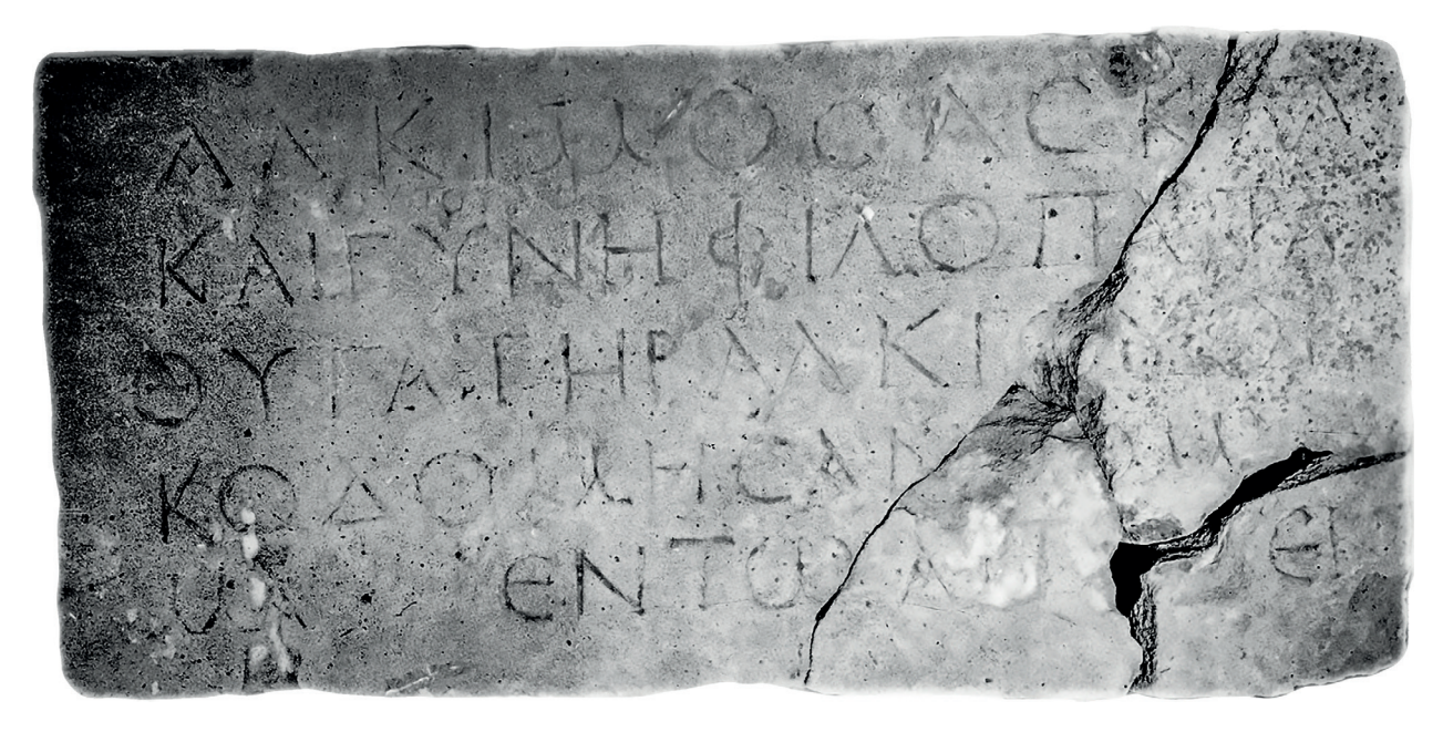
Fig. 5. Inscription of Alkimos and Philopatra