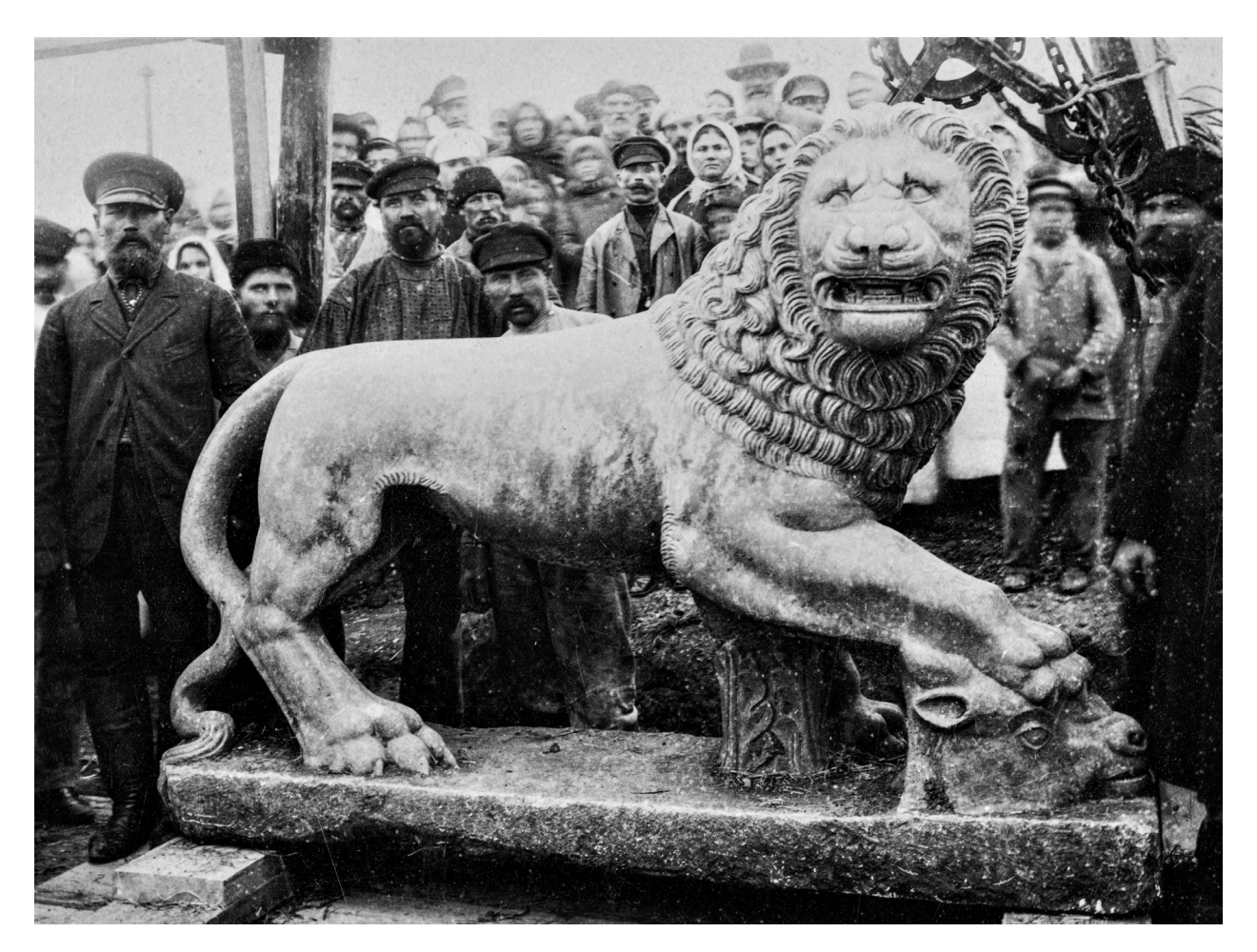
Fig. 3. Lion statue after lifting out of the pit (Photograph from Scientific Archive of the Institute for the History of Material Culture, St.-Petersburg: fund 1, 1894, case 158, page 152)

Fig. 2. Lion Tumulus. Statue of lion in the discovery moment (Photograph from Scientific Archive of the Institute for the History of Material Culture, St.-Petersburg: fund 1, 1894, case 158, page 150)