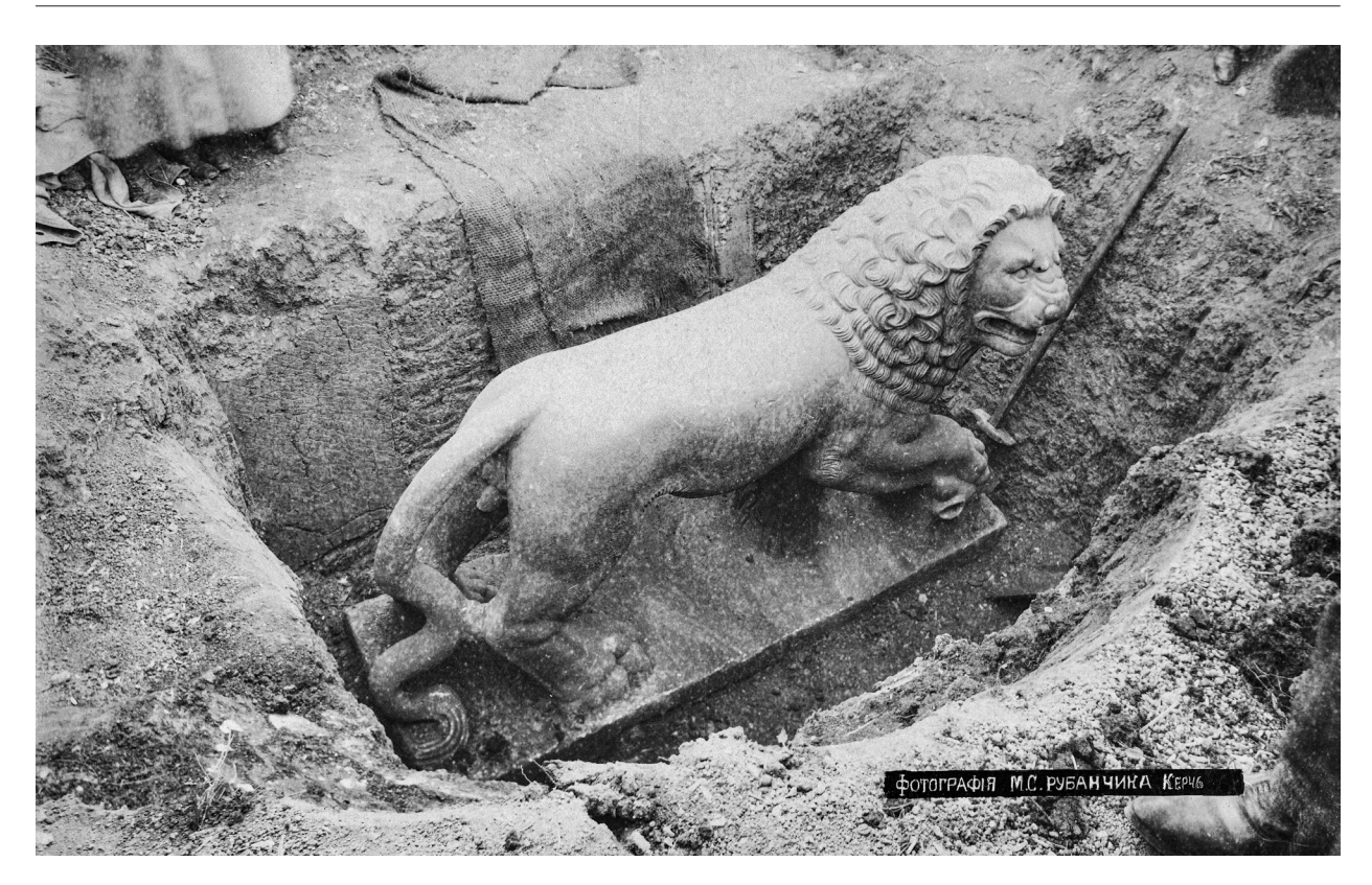
Fig. 2. Lion Tumulus. Statue of lion in the discovery moment