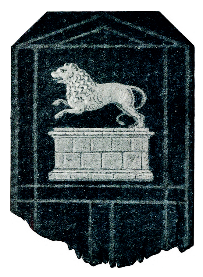
Fig. 4. Fragment of wooden sarcophagus found at Kerch in 1872 (by Rostovtsev 1913, 215, rys. 44)

In his report Karl Dumberg specifically noted the fact that the sarcophagus, the inscribed slab and the slabs with tamga-signs were made of the same material, a type of sandstone which is not to be found on the Kerch Peninsula. Its nearest deposits are found about 200 km to the west. It is interesting to note that similar signs to the tamga-signs found in the tumulus, are also to be found to the west of the boundaries of Bosporus: in Scythian Neapolis, Chersonesus and Olbia.<sup>10</sup> How is this to be explained? If we take the traditional date of construction of the Lion Tumulus, it is possible that it is associated with political events that took place at this time on the Bosporus. The termination of the emission of local gold staters between 10/11 and 13/14 AD, obviously testifies to a struggle for power in these years, and the short-term occupation of the Bosporan throne by a the ruler not recognized by Rome.11 Apparently this ruler, who was buried in the Lion Tumulus, was associated with the late Scythians and Sarmatian clans